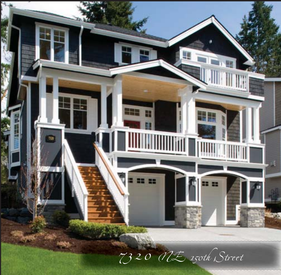
7320 NE 150th Street